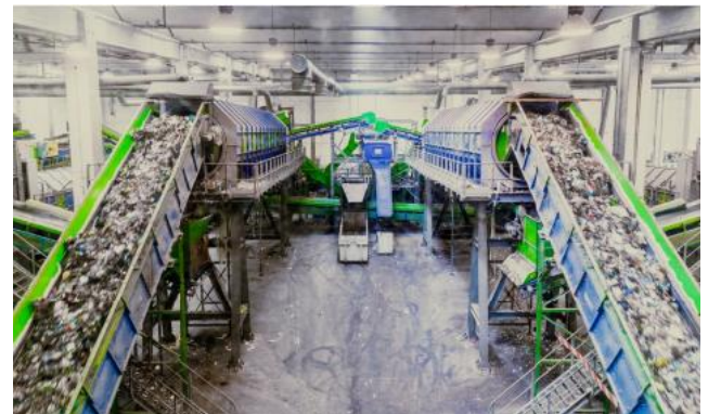
Oil resistant belts in the recycling industry